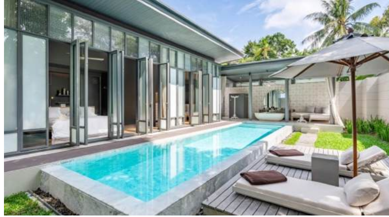
SALA Phuket Mai Khao Beach Resort, 2006