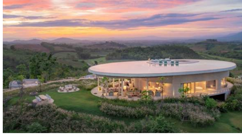
sala khaoyai, 2009