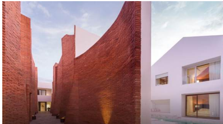
sala ayutthaya, 2014