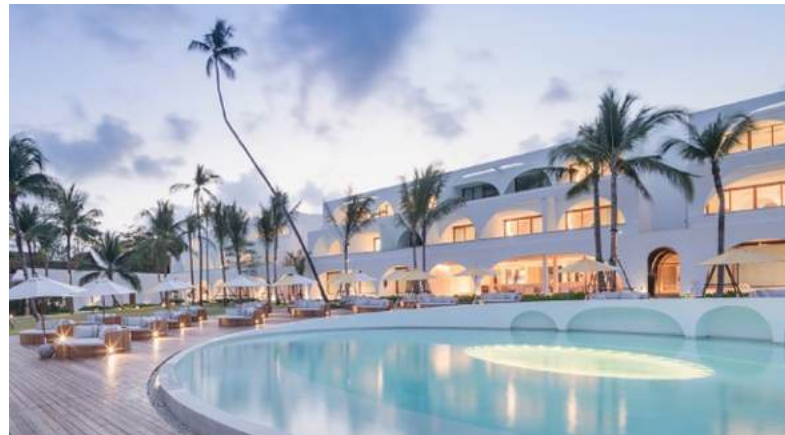
SALA Samui Chaweng Beach Resort, 2018