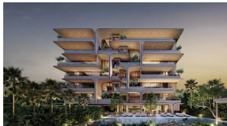
SURFHOUSE Phuket Bang Tao, 2024