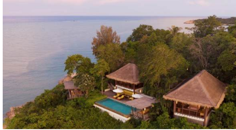
Six Senses Samui, 2004