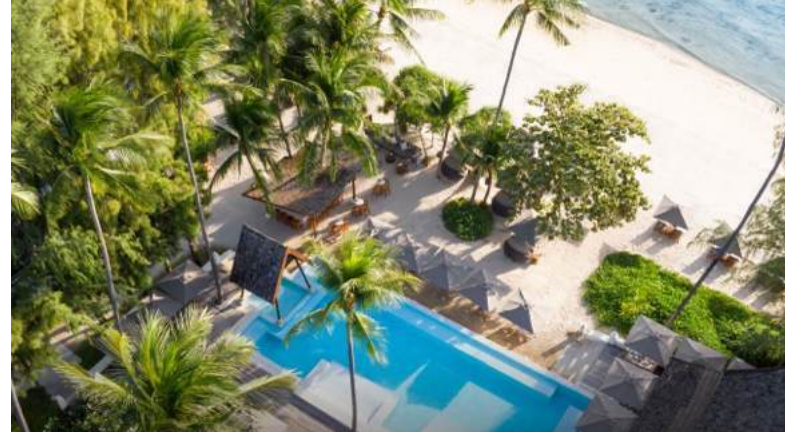
SALA Samui Choengmon Beach Resort, 2004