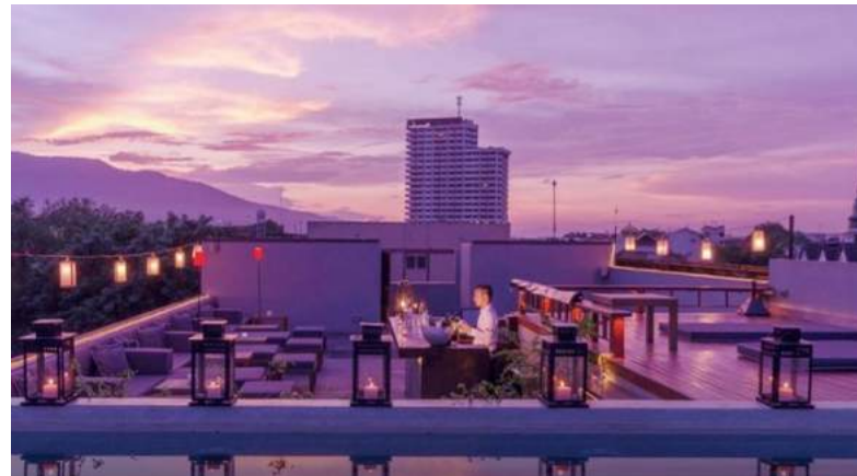
sala lanna Chiang Mai, 2013