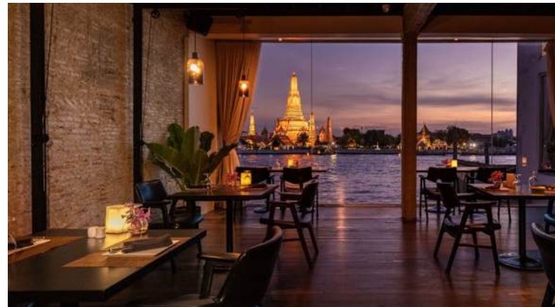
sala rattanakosin Bangkok, 2013