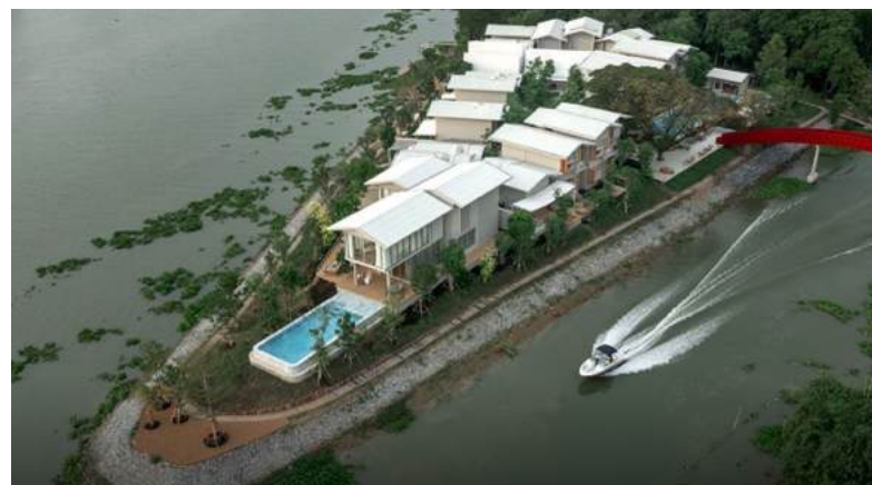
sala bang pa-in, 2021